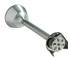
Emulsifying disk Ref. : AC523