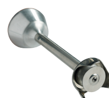
Beater disk Ref. : AC522