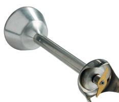
Standard knife - 2 blades Ref. : AC521