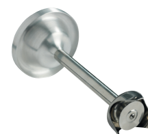
Beater disk Ref. : AC532