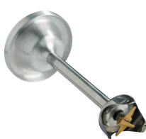
Emulsifying knife - 4 blades Ref. : AC530