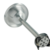
Emulsifying disk Ref. : AC533